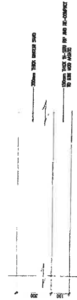
SAND PIT LAYER WORKS DETAIL (1:10)