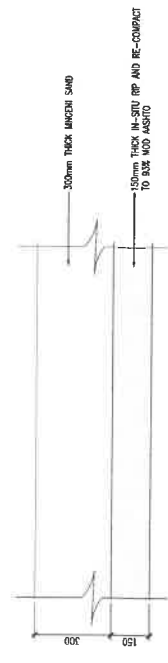
SAND PIT LAYER WORKS DETAIL (1:10)